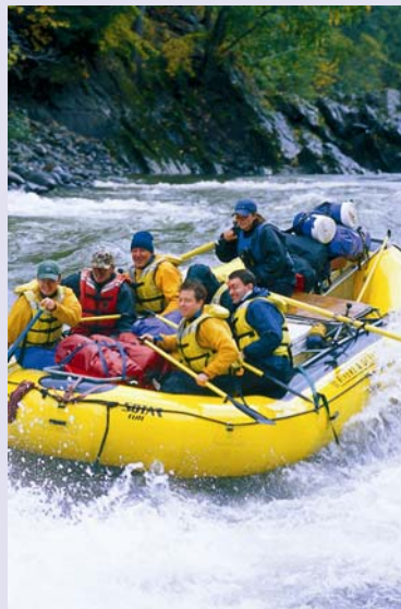
Grizzly Drop—Babine River

We didn't raft over the winter but the walls of ice on the river side gravel bars attest to the winter's climate.